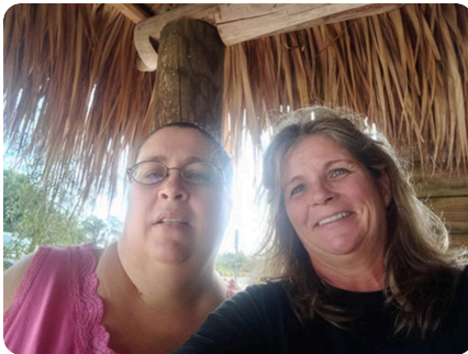
Daddy you will always be with us. We love you forever and ever.