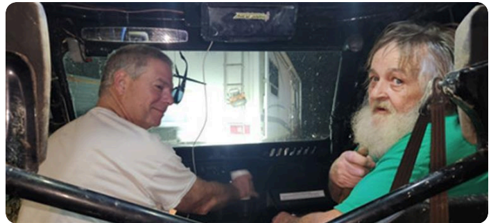
Will always love the knowledge, and experiences you taught me grandpa. You were always the reason...